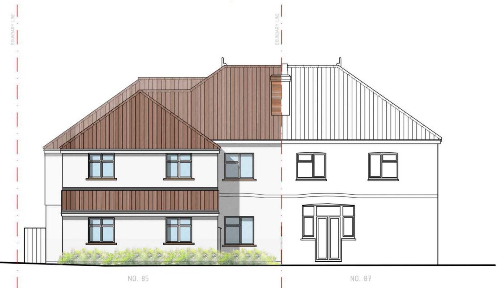
AS PROPOSED REAR ELEVATION