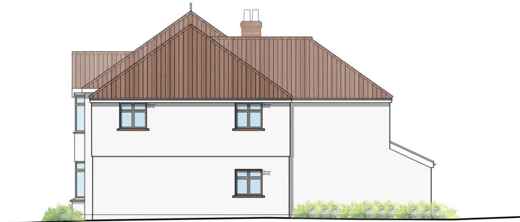
AS PROPOSED SIDE ELEVATION