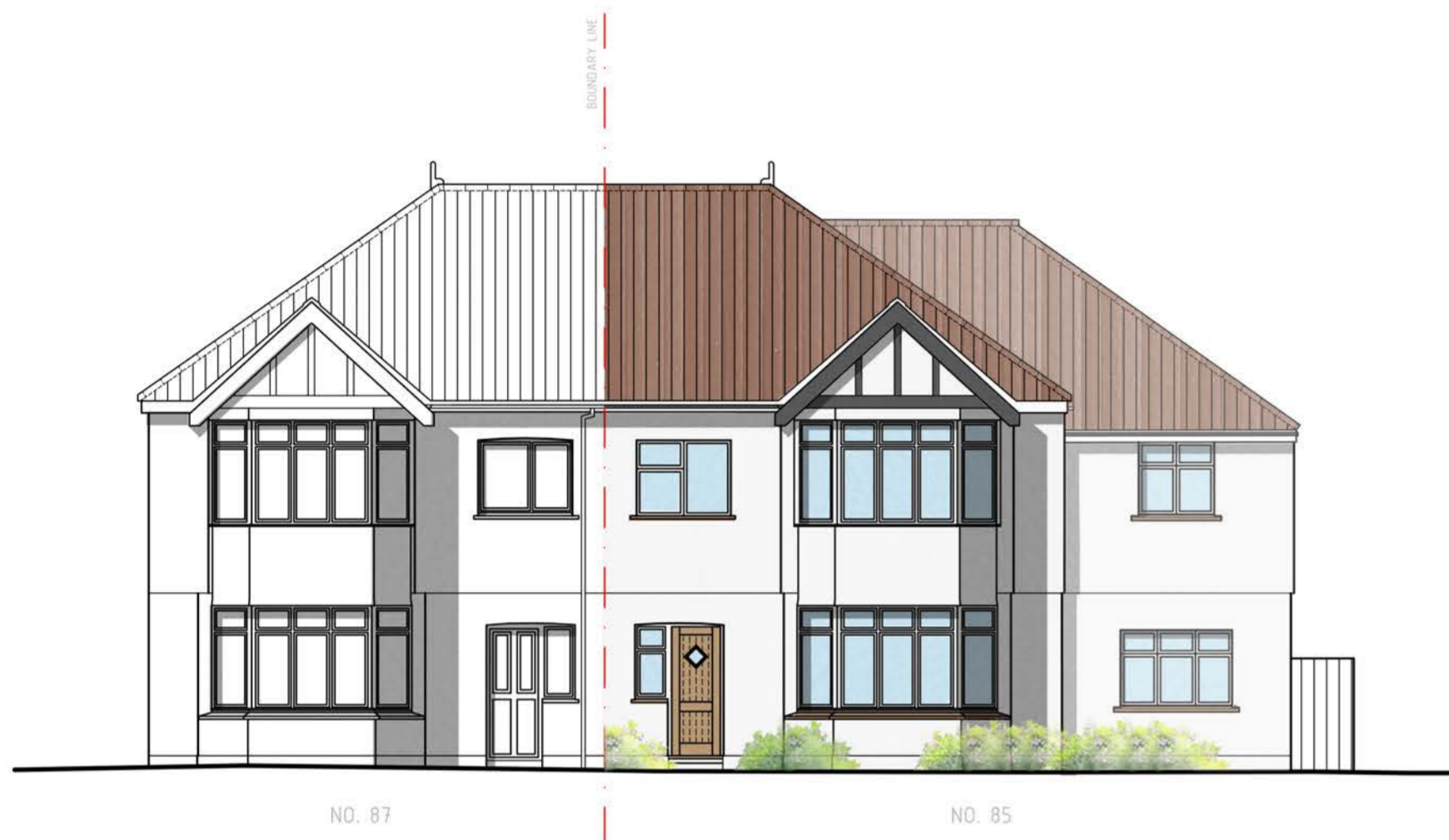
AS PROPOSED FRONT ELEVATION

This drawing is to be read in conjunction with all Architect's drawings, schedules and specifications, and all relevant consultants and/or specialists' information relating to the project. Refer all discrepancies to DAP Architecture Ltd.